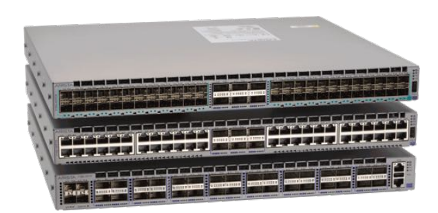
Arista 7160 Series of Data Center Switches

25GbE interfaces with SFP and 100GbE with QSFP on the 7160 Series enables flexible choices of port speed providing unparalleled flexibility and the ability to seamlessly transition data centers to the next generation of Ethernet performance. The 7160 Series provide industry leading power efficiency with airflow choices for back to front, or front to back. Combined with Arista EOS the 7160 Series delivers advanced features for cloud, big data, virtualized and traditional designs.