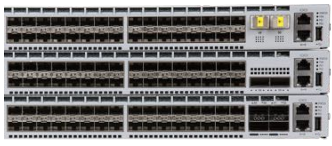
Arista 7280E Flexible Port Combinations

7280SE-64: 4 QSFP+ ports for 4x 40G or 16x10G