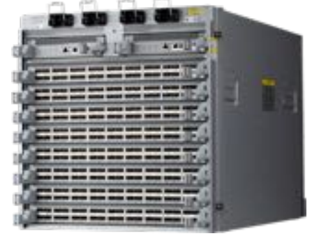
Arista 7500E Series Modular Data Center Switches