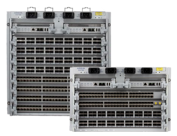
Arista 7500 Series Chassis

The 7500E series switches are equipped with four 2900W AC power supplies. The power supplies are 2+2 grid redundant and hot-swappable. The power supplies are gold climate saver rated and have an efficiency of over 90% with single stage conversion to the internal 12V DC voltage.