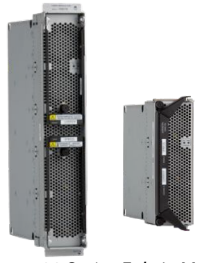
Arista 7500 Series Fabric Modules