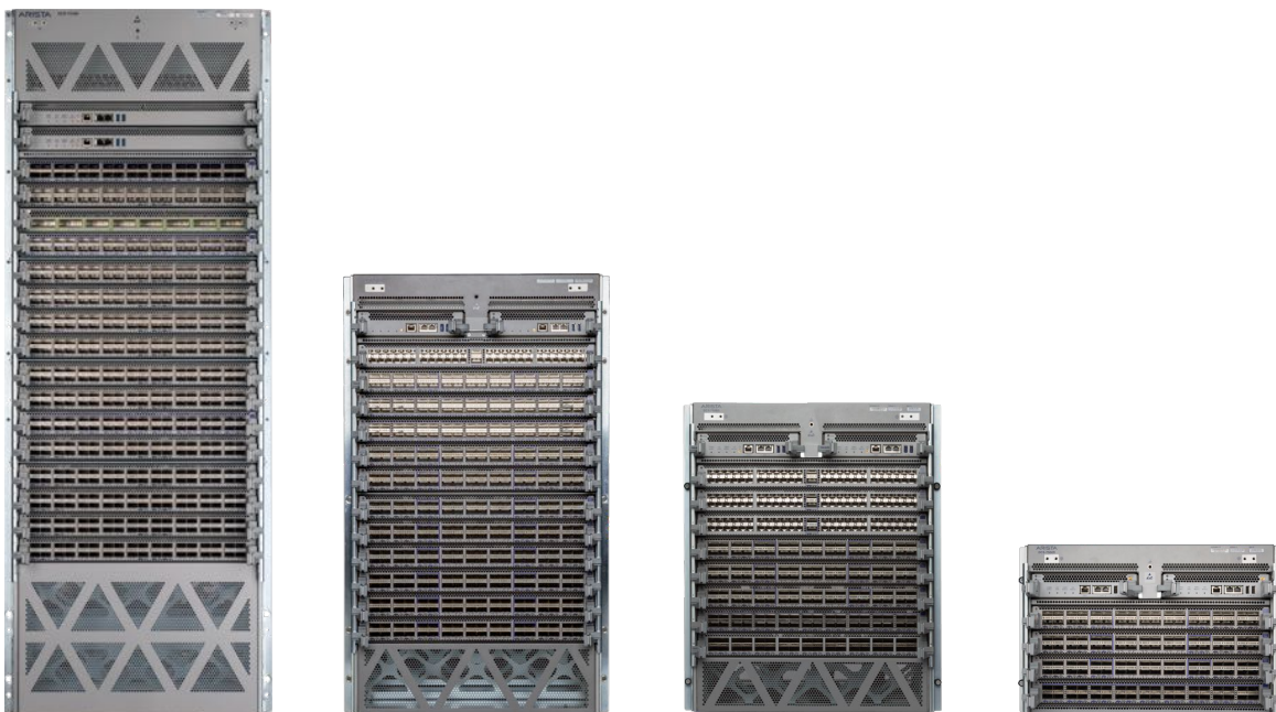
Arista 7500R Series Chassis (left to right) - 7516R, 7512R, 7508R and 7504R

The 7500R Series chassis each provide room for two supervisor modules, four, eight, twelve or sixteen line card modules, grid redundant power supply modules, and six fabric modules. Supervisor and line card modules plug in from the front, while the fabric modules and power supplies are inserted from the rear. The system uses a completely passive midplane and provides control plane connectivity to each of the fabric and line card modules. The system design is optimized for data center deployments with front-to-rear airflow.