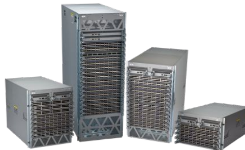
Arista 7500R Series Modular Data Center Switches

All components are hot swappable, with redundant supervisor, power, fabric and cooling modules with front-to-rear airflow. The system is purpose built for data centers and is energy efficient with typical power consumption of under 25 watts per 100GbE port for a fully configured chassis. These attributes make the Arista 7500R an ideal platform for building reliable and highly scalable data center networks.